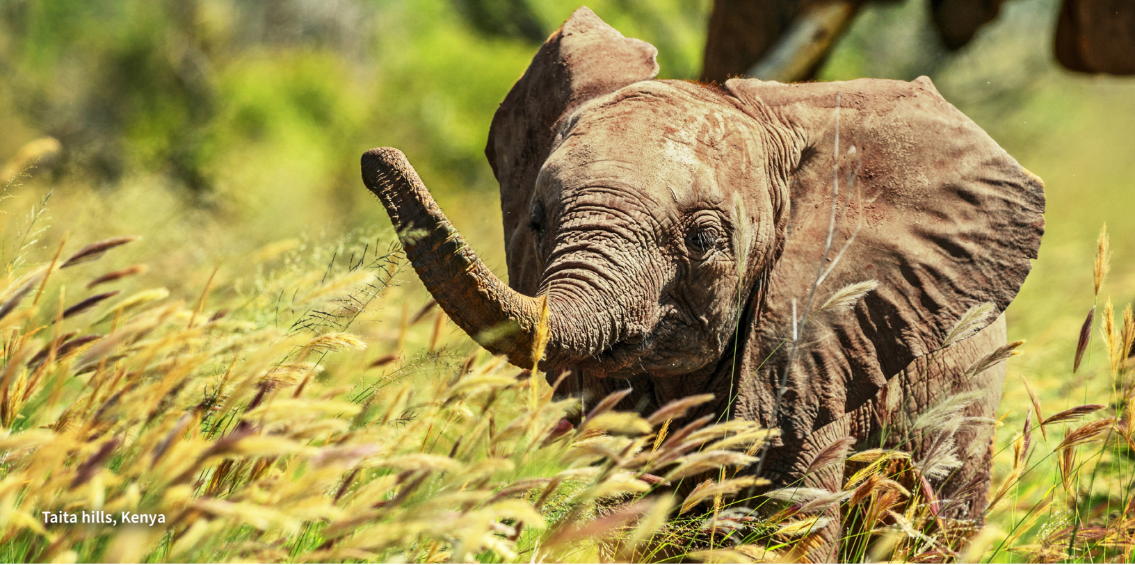
Taita hills, Kenya