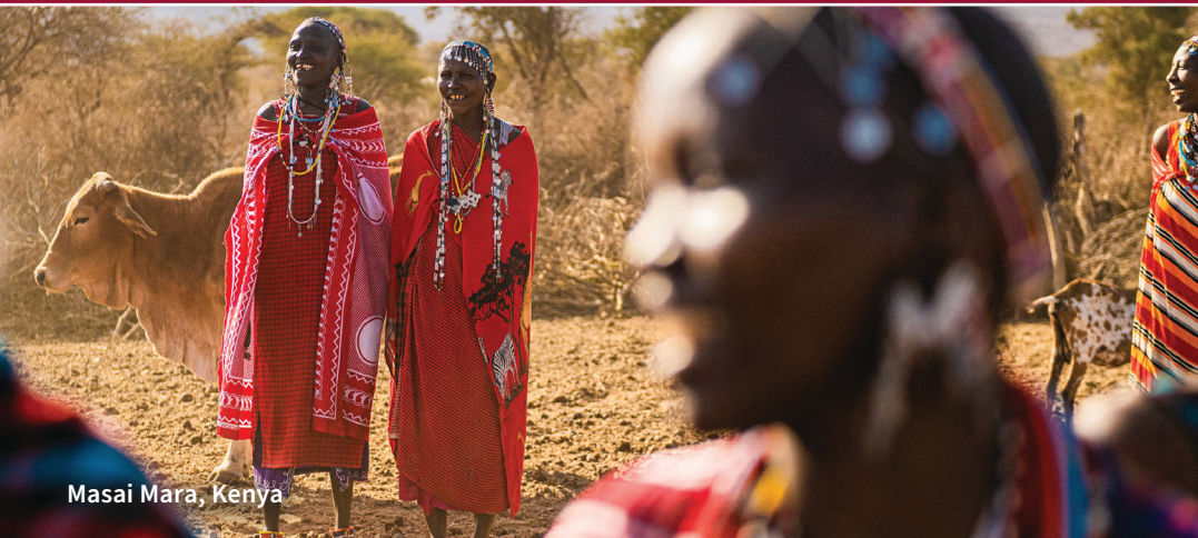
Masai Mara, Kenya