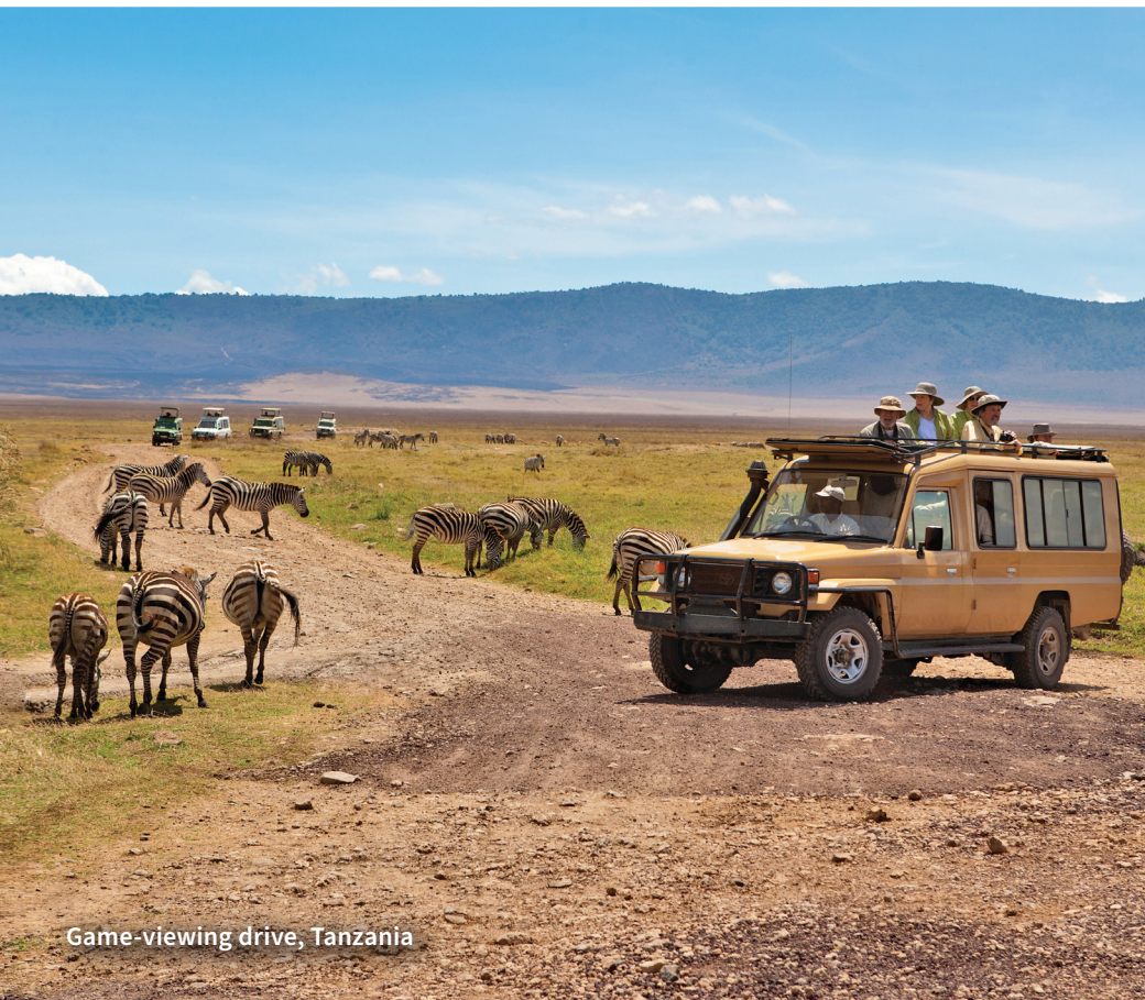
Game-viewing drive, Tanzania